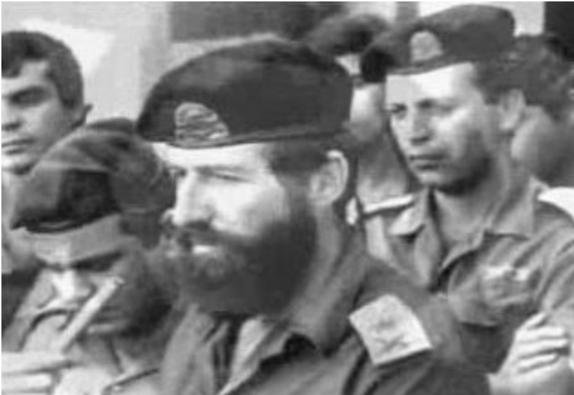
Figure 1 Labor leader Mitsna (bearded man in foreground) in uniform.

First, the counter-imaging technique attempted to establish the party's military ethos: Labor leader Mitsna in uniform (Figure 1), in a