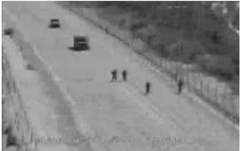
Figure 2 Israeli soldiers patrolling the border. Image from Mitsna election campaign.

helicopter and on patrol, along with historical footage of his military experience (Figure 2), symbolized that he and Labor as a whole were committed to security. The constant juxtapositioning of martyred Israeli hero Yitzchak Rabin along with countless military testimonials attempt to establish Labor as the party of strength. It ought to be noted that the majority of Labor leaders shown in the ads are indeed former generals in the Israeli army (see Table 3). On the other hand, most Oslo Accord-related Labor Party figures do not appear in any of the ads. This serves as evidence that in using counter-imaging, the Labor Party tried to distance itself from the unpopular Accords (at the time of the election) and to establish its place as a center rather than left-wing party.